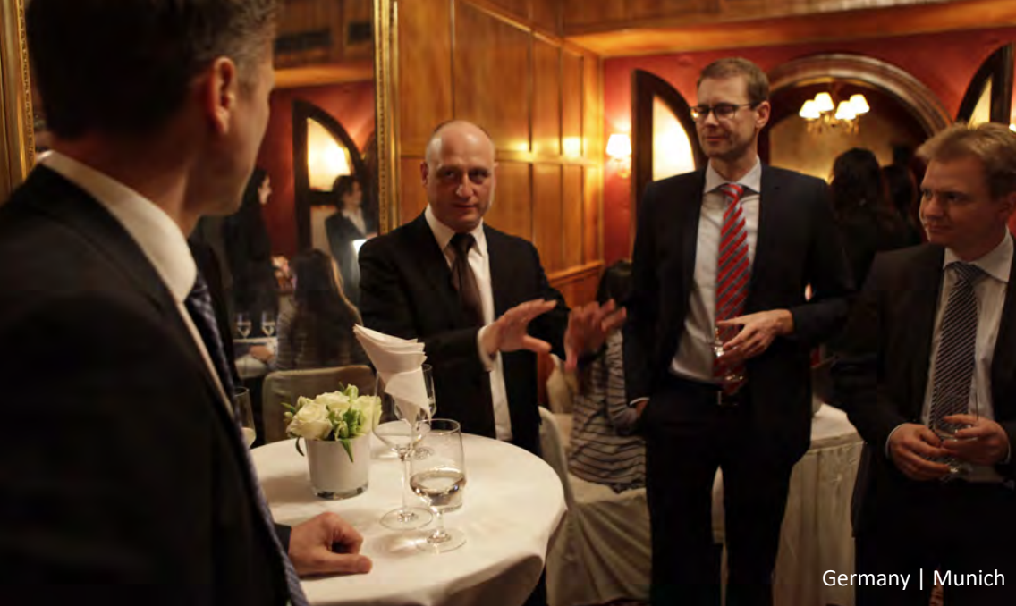
Germany | Munich