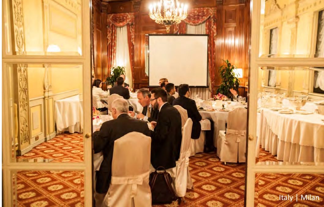
Italy | Milan

"It was a pleasure share this activity with you and all attendees. I truly believe it was very helpful to develop a business network spending a good time with pairs and colleagues."