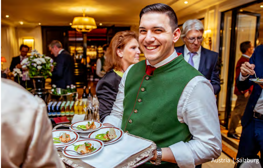
Austria | Salzburg