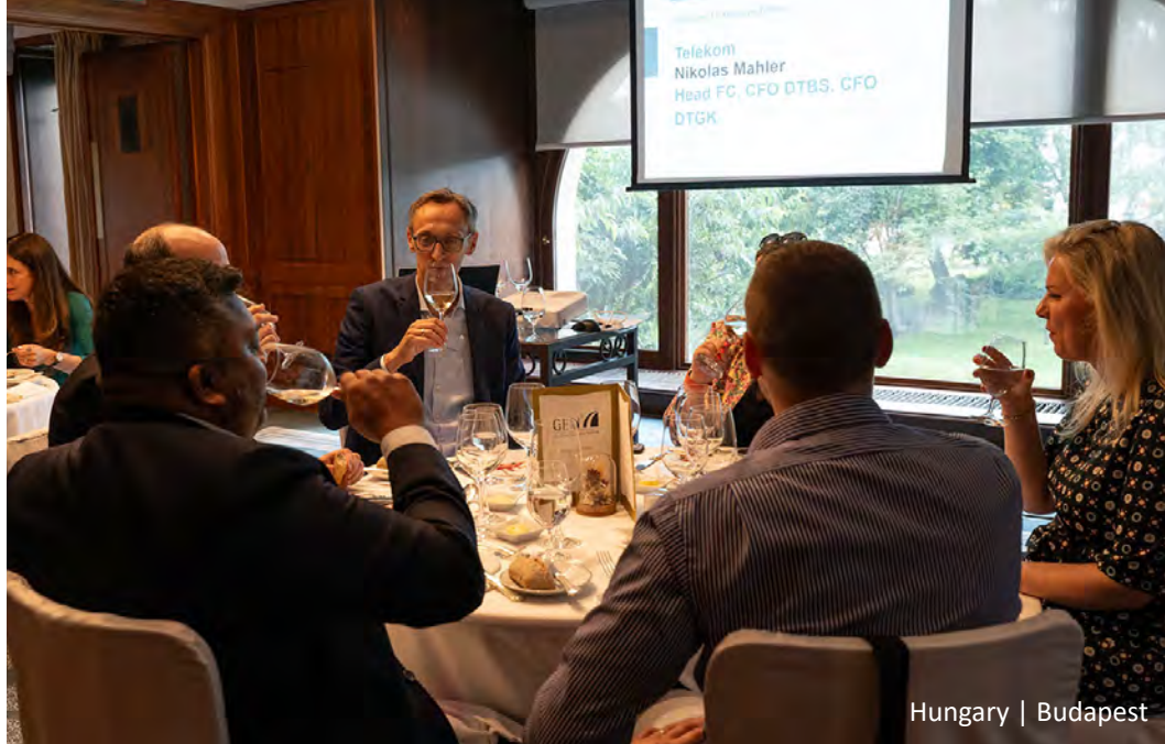
Hungary | Budapest

"I was very impressed — it was a great evening and the attendees were above what I expected if I'm honest. Your team on site also did a great job.