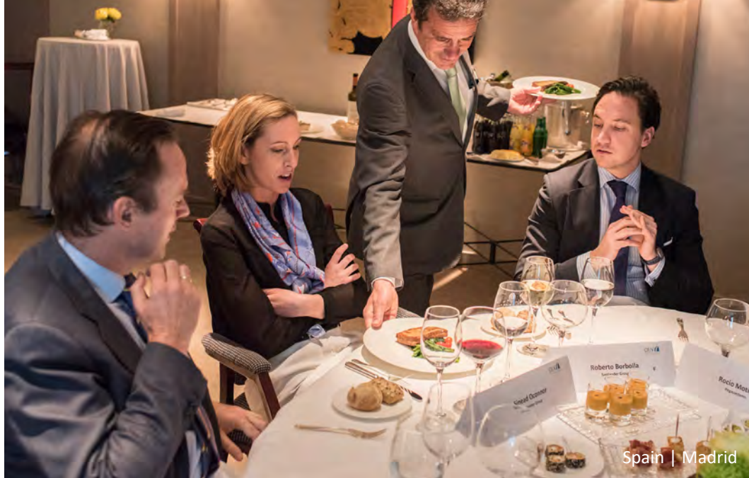
Spain | Madrid

"Thank you for hosting a very successful Networking event yesterday. I hope the Zurich one tonight also will be a success."