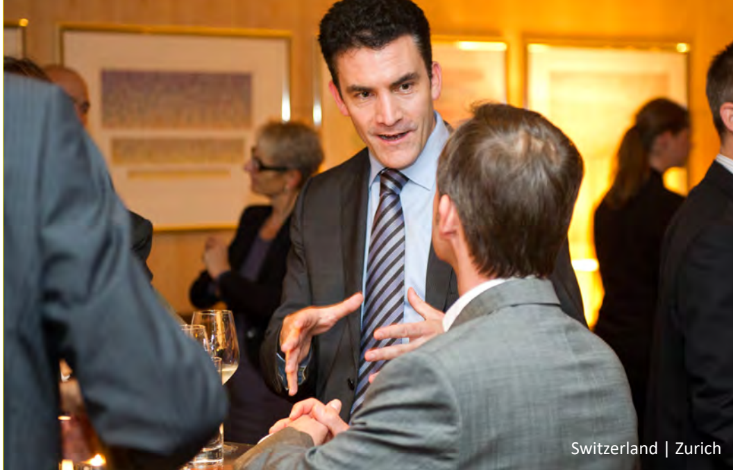
Switzerland | Zurich

“Was great to meet last night and well done to you and the team on a great event! I thought the event was very well organized, the location (room sizing etc.) was perfect. As regards the agenda, the duration and content was both relevant and succinct. It was great to see audience participation and high attendance – I know that certainly in my group there was a lot of sharing of data and we hope to connect some of these companies more formally off the back of the event.