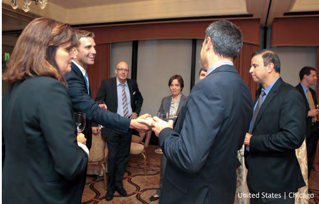
United States | Chicago