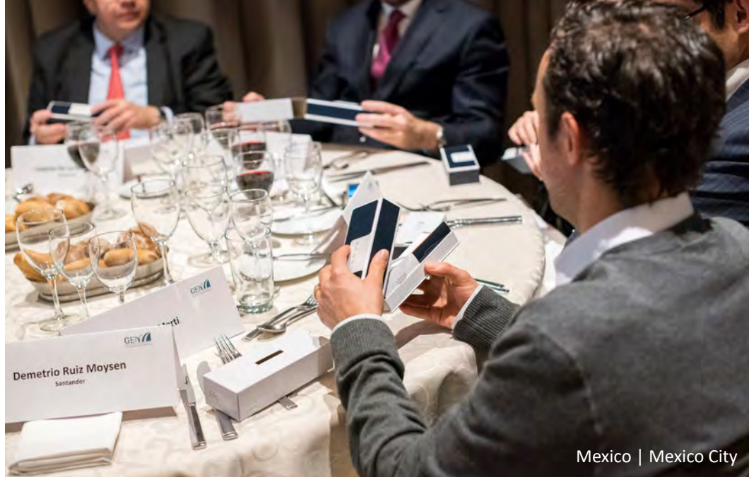
Mexico | Mexico City

"We have a hot opportunity to engage with one of the customers that requires immediate attention."