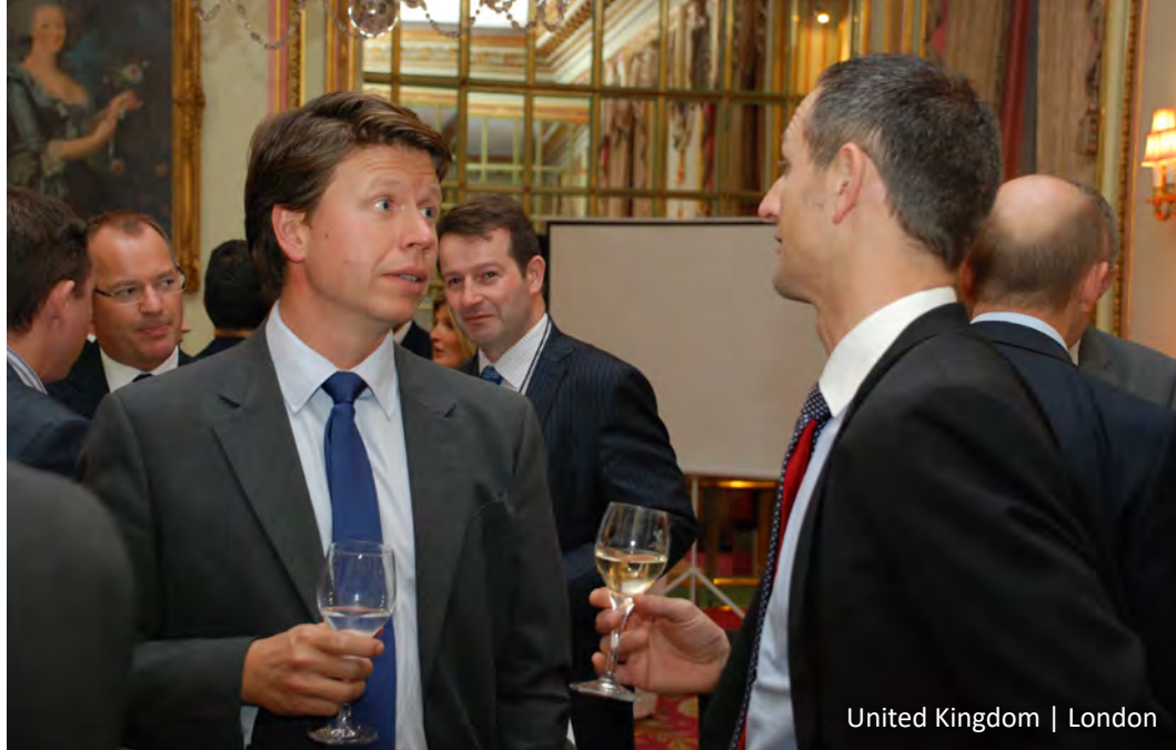
United Kingdom | London

"My first GEN event. The event was put together in a very professional way, venue was great, and the team was meticulous. The attendees were a mix of professional not necessary working in the same executive function but sharing a common issue which was the topic of discussion of the night. "Pleasure working with you. "